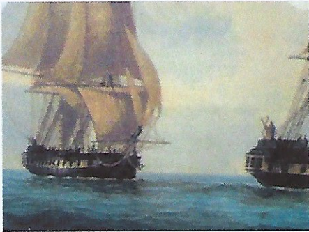
Drawing by Duché de Vancy 1786

The Friends of the Lapérouse Museum (FOLM) wish to finance a model of the Astrolabe windmill to be exhibited in the La Perouse Museum and suggest a contribution from supporters.